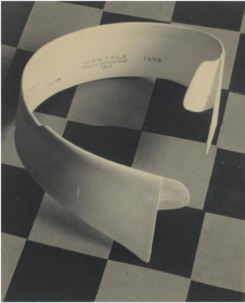
PAUL OUTERBRIDGE JR. (1896-1958) Ide Collar, 1922 Estimate: $250,000-350,000