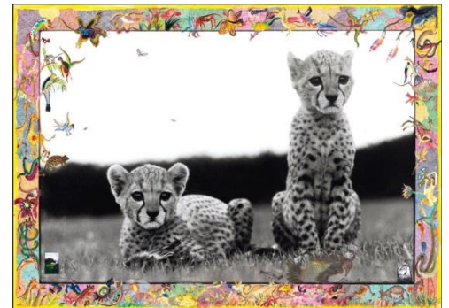
PETER BEARD (B. 1938) Orphaned Cheetah Cubs, Mweiga, near Nyeri, Kenta, March 1968 Estimate: $300,000-500,000