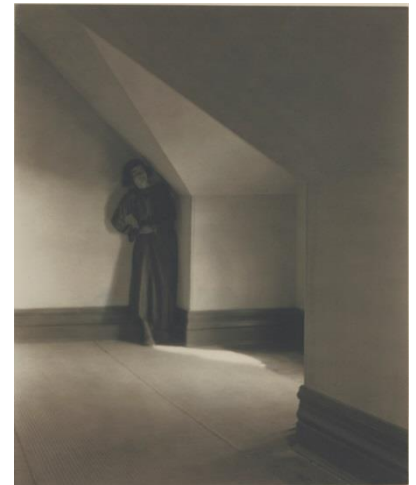
EDWARD WESTON (1886-1958) Betty in Her Attic, 1920 Estimate: $600,000-900,000