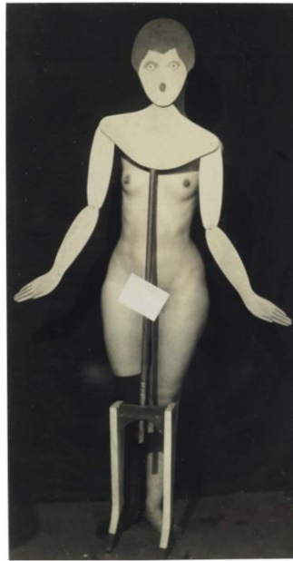
MAN RAY (1890-1976) Dadaphoto, 1920 Estimate: $100,000-150,000