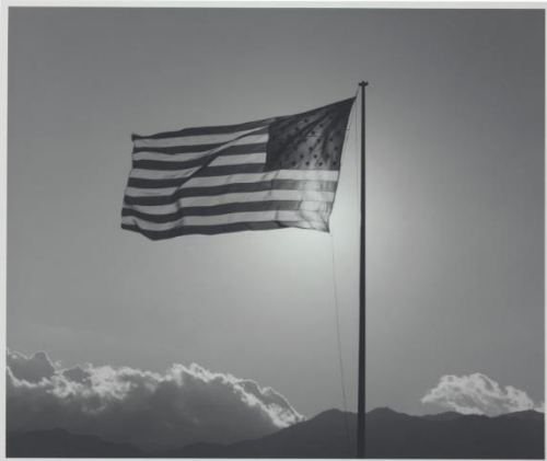
ROBERT MAPPLETHORPE (1946–1989) Flag, 1987 Estimate: $80,000-120,000