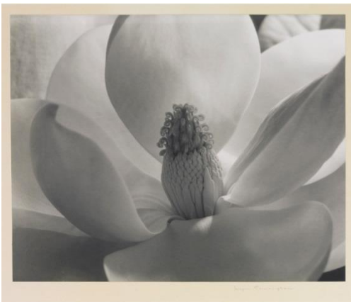
IMOGEN CUNNINGHAM (1883-1976) Magnolia Blossom, 1925 Estimate: $100,000-200,000