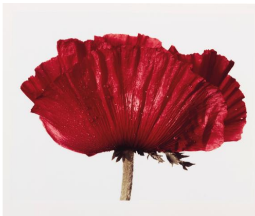
IRVING PENN (1917–2009) Poppy: Glowing Embers, New York, 1968 Estimate: $150,000-250,000